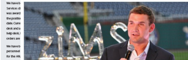
Washington Nationals Third Baseman Ryan Zimmerman started the zIMS Foundation in the hopes of curing for Multiple Sclerosis.